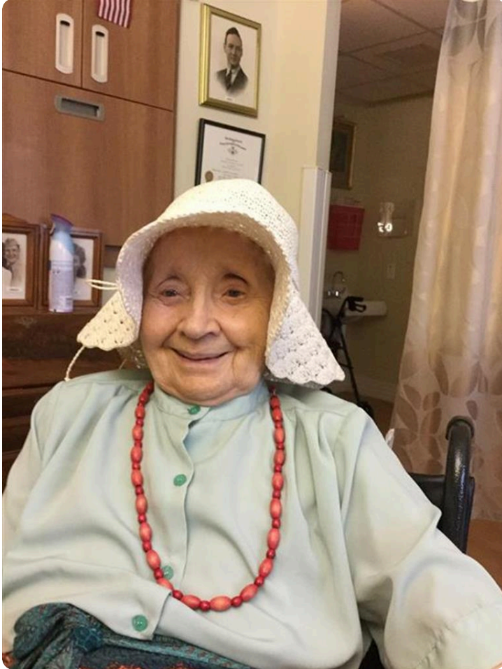
Ready to go outside